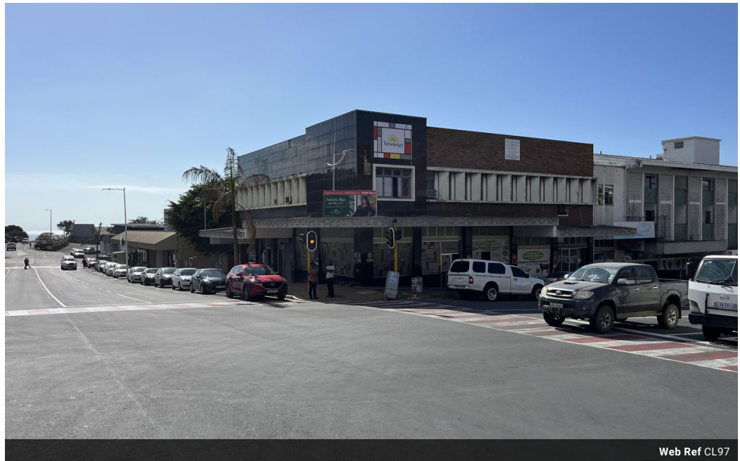
Web Ref CL97

No 1 Bank Street (Corner Bank Street and Marine Drive) Margate KwaZulu Natal