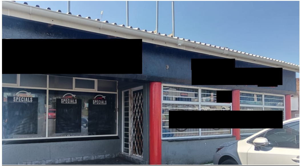
Web Ref CL139