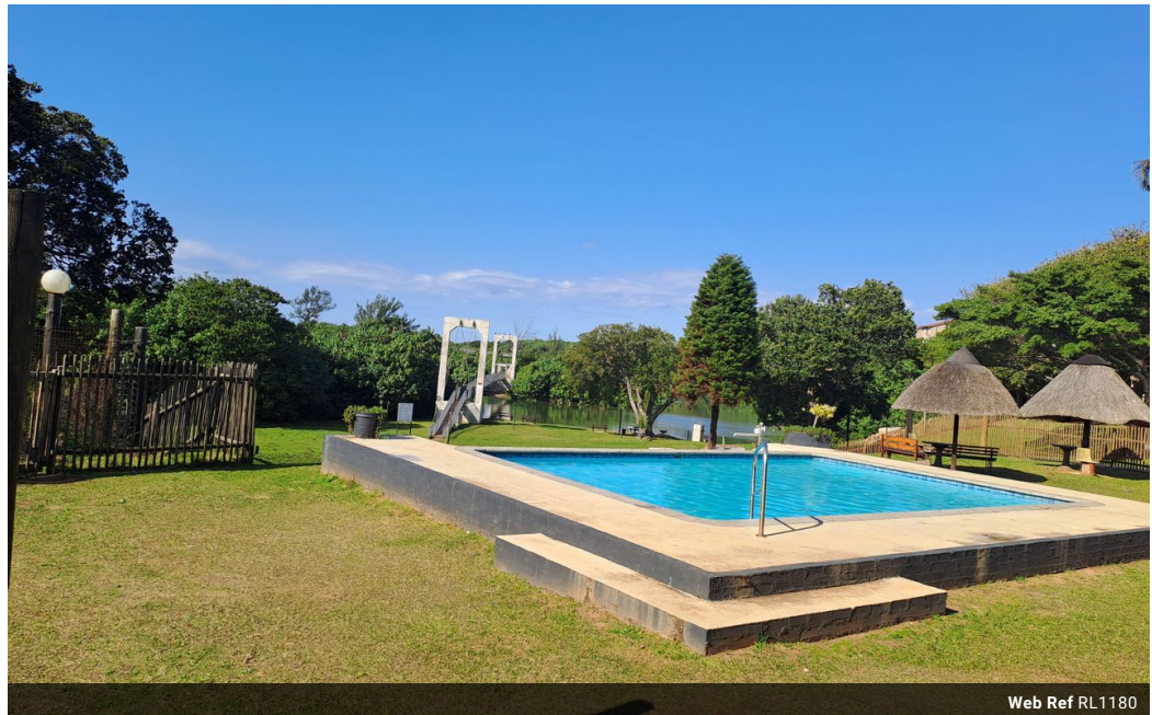
Web Ref RL1180

No 1 Bank Street (Corner Bank Street and Marine Drive) Margate KwaZulu Natal