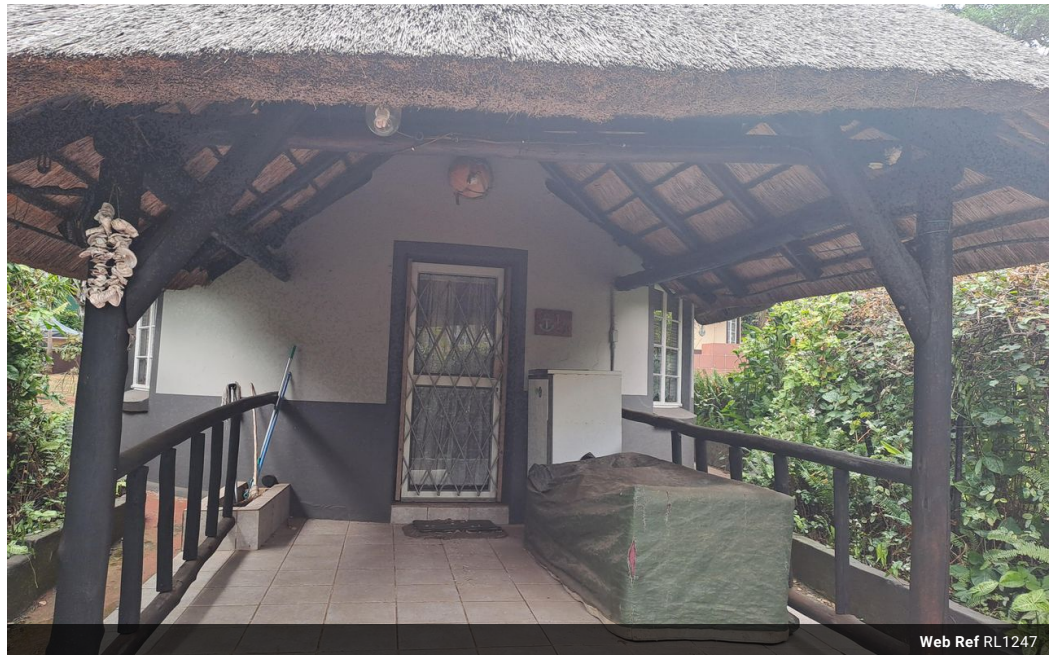
Web Ref RL1247

No 1 Bank Street (Corner Bank Street and Marine Drive) Margate KwaZulu Natal