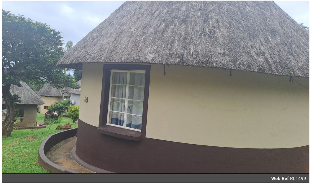
Web Ref RL1499

No 1 Bank Street (Corner Bank Street and Marine Drive) Margate KwaZulu Natal