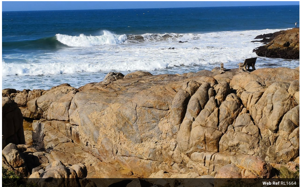
Web Ref RL1664

No 1 Bank Street (Corner Bank Street and Marine Drive) Margate KwaZulu Natal