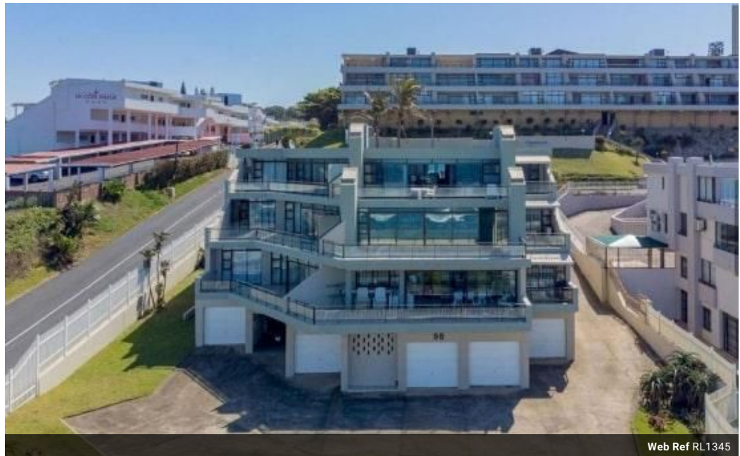
Web Ref RL1345

No 1 Bank Street (Corner Bank Street and Marine Drive) Margate KwaZulu Natal