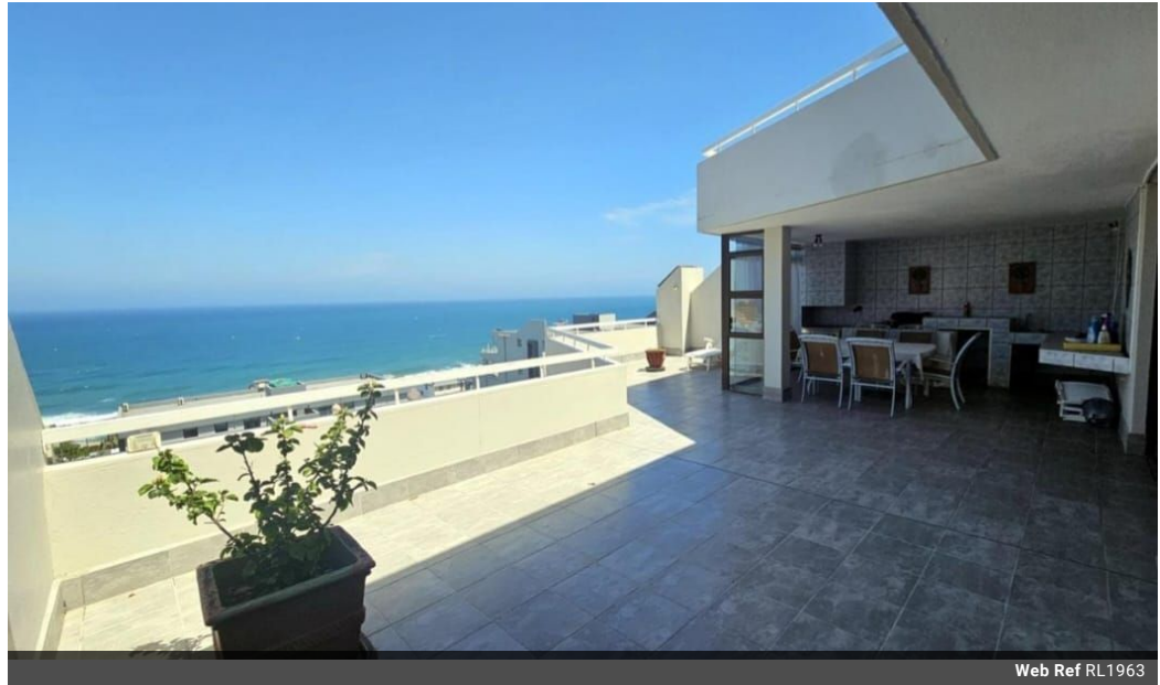
Web Ref RL1963

No 1 Bank Street (Corner Bank Street and Marine Drive) Margate KwaZulu Natal