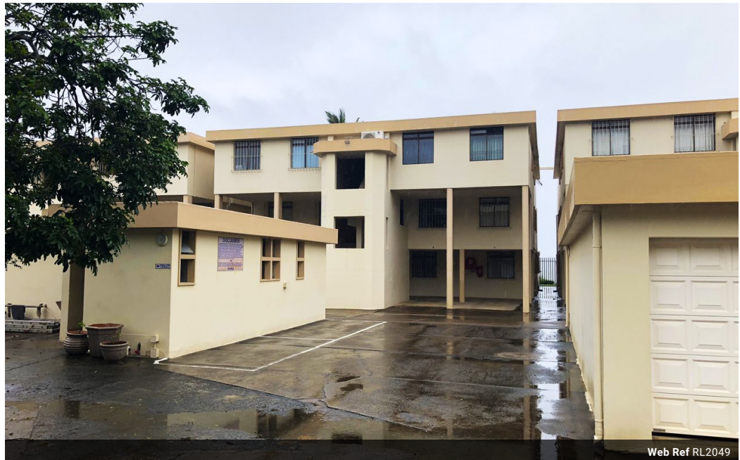
Web Ref RL2049

No 1 Bank Street (Corner Bank Street and Marine Drive) Margate KwaZulu Natal