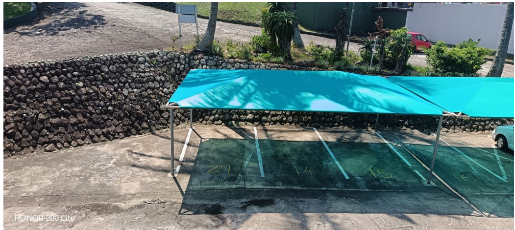
HONOR 200 Lite

No 1 Bank Street (Corner Bank Street and Marine Drive) Margate KwaZulu Natal