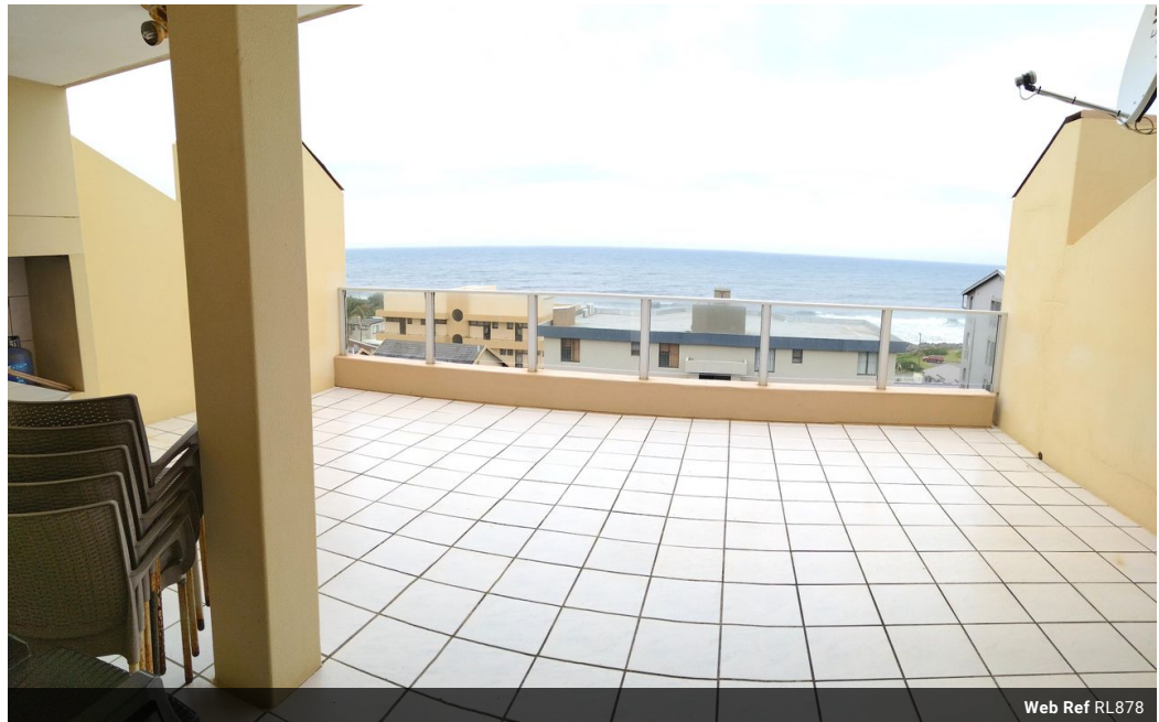
Web Ref RL878

No 1 Bank Street (Corner Bank Street and Marine Drive) Margate KwaZulu Natal