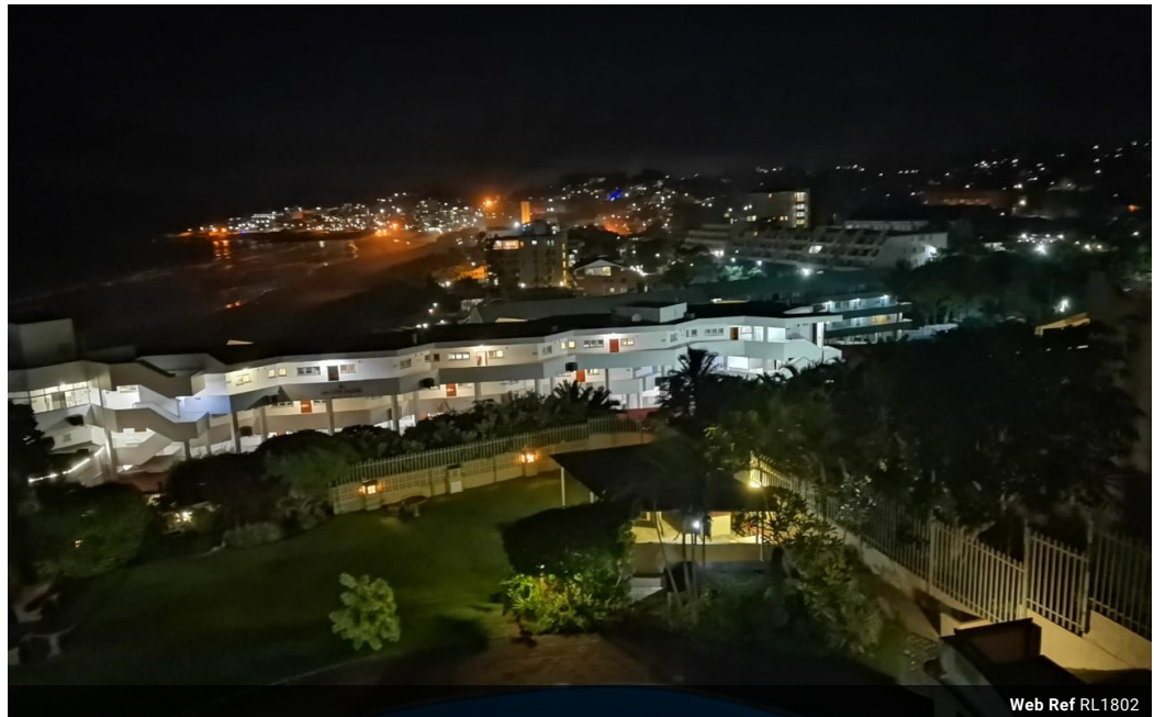
Web Ref RL1802

No 1 Bank Street (Corner Bank Street and Marine Drive) Margate KwaZulu Natal