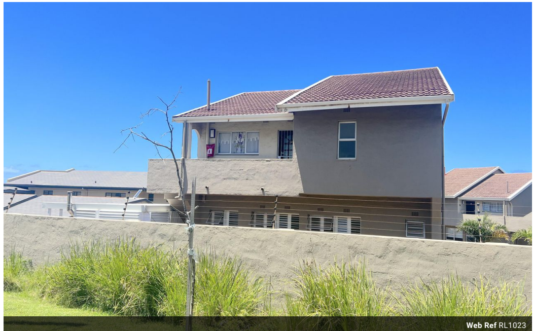
Web Ref RL1023

No 1 Bank Street (Corner Bank Street and Marine Drive) Margate KwaZulu Natal