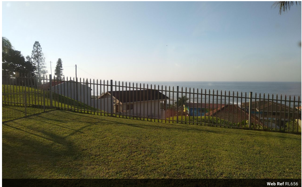
Web Ref RL656

No 1 Bank Street (Corner Bank Street and Marine Drive) Margate KwaZulu Natal