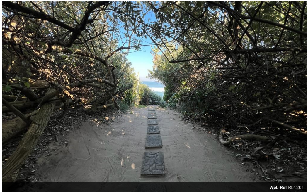
Web Ref RL1201

No 1 Bank Street (Corner Bank Street and Marine Drive) Margate KwaZulu Natal