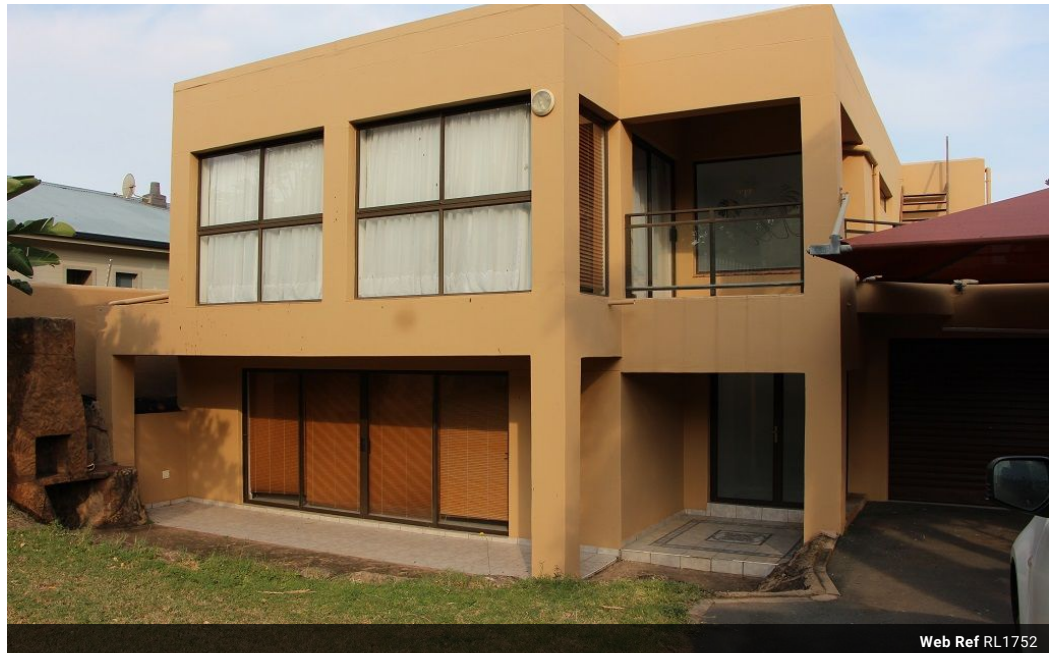
Web Ref RL1752

No 1 Bank Street (Corner Bank Street and Marine Drive) Margate KwaZulu Natal