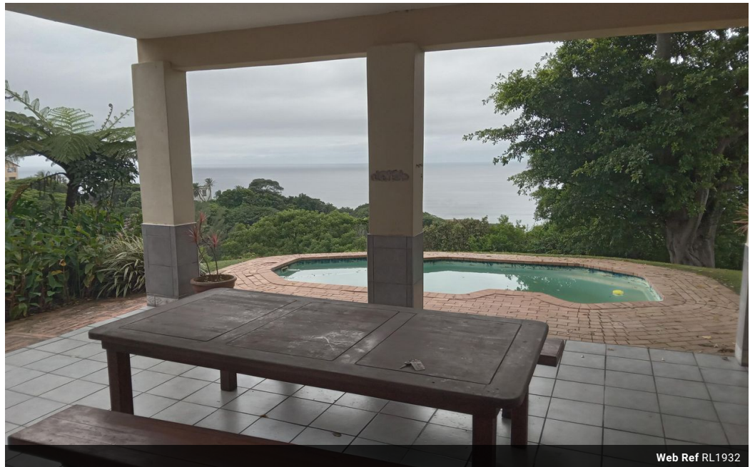
Web Ref RL1932

No 1 Bank Street (Corner Bank Street and Marine Drive) Margate KwaZulu Natal