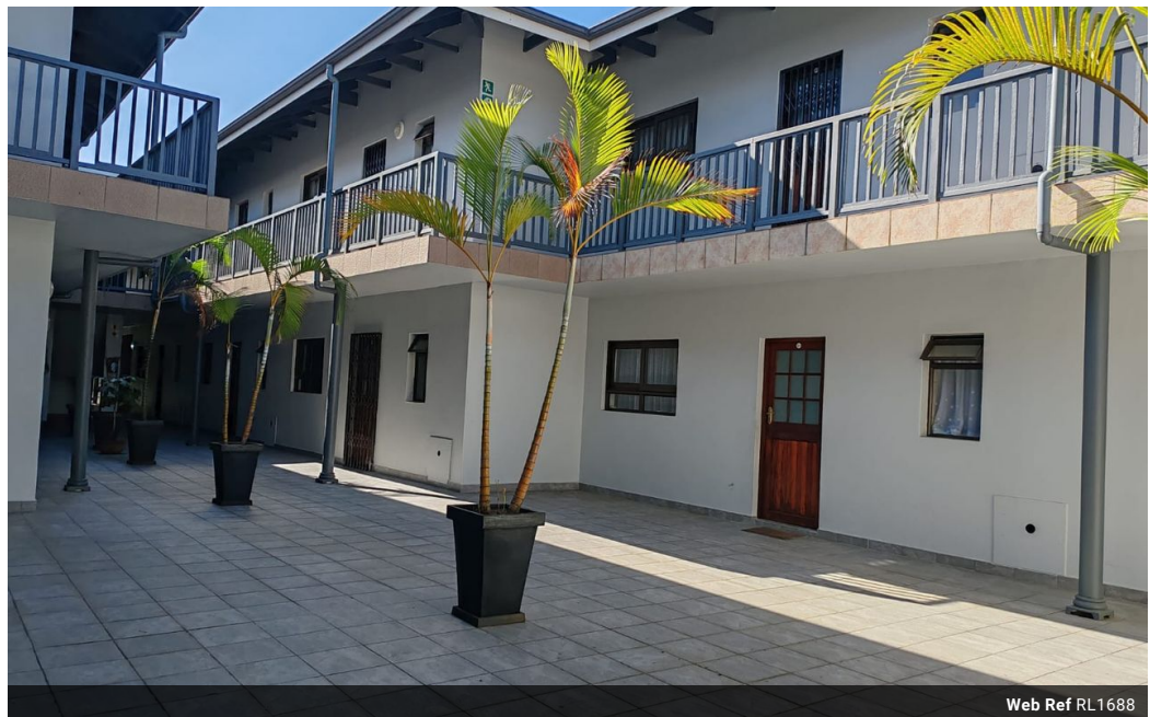
Web Ref RL1688

No 1 Bank Street (Corner Bank Street and Marine Drive) Margate KwaZulu Natal