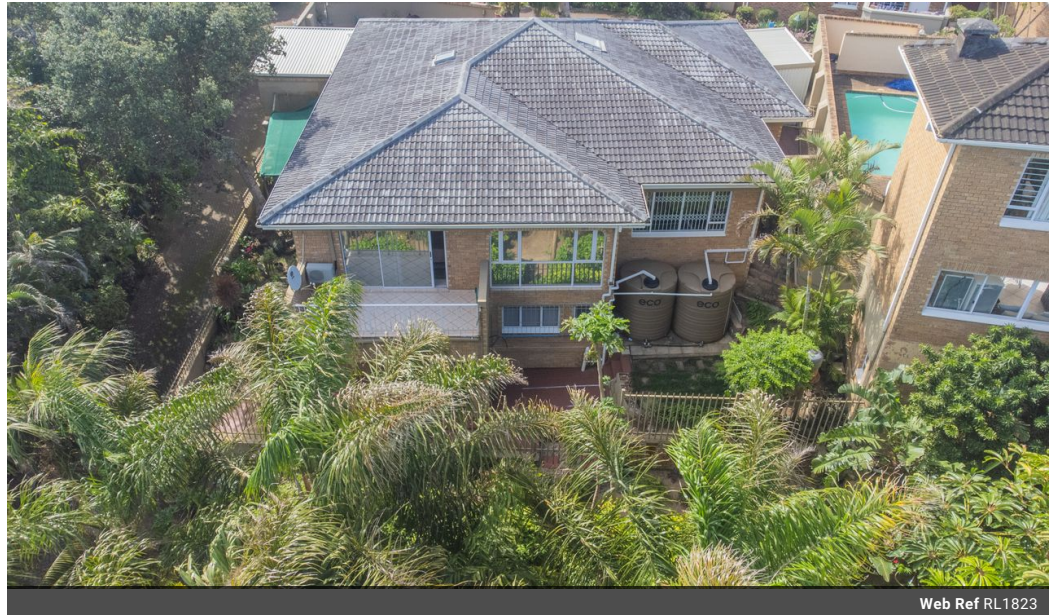
Web Ref RL1823

No 1 Bank Street (Corner Bank Street and Marine Drive) Margate KwaZulu Natal