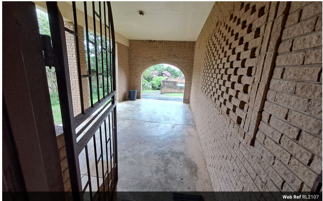
Web Ref RL2107

No 1 Bank Street (Corner Bank Street and Marine Drive) Margate KwaZulu Natal