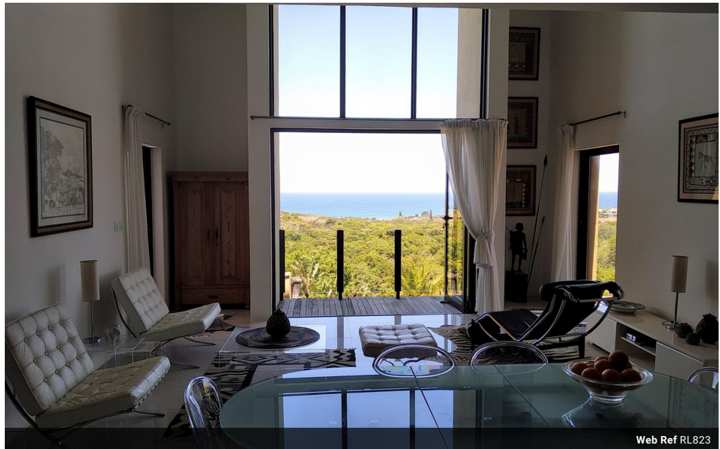
Web Ref RL823

No 1 Bank Street (Corner Bank Street and Marine Drive) Margate KwaZulu Natal