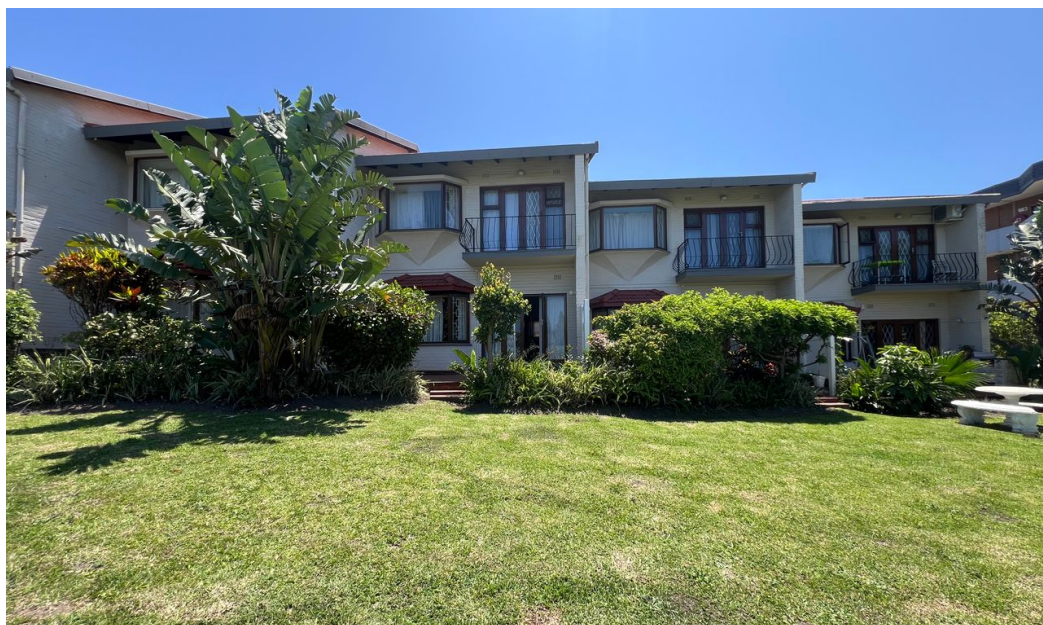
Web Ref RL1817

No 1 Bank Street (Corner Bank Street and Marine Drive) Margate KwaZulu Natal