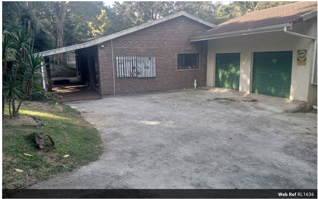
Web Ref RL1636

No 1 Bank Street (Corner Bank Street and Marine Drive) Margate KwaZulu Natal