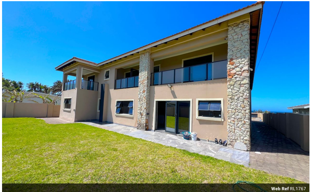
Web Ref RL1767

No 1 Bank Street (Corner Bank Street and Marine Drive) Margate KwaZulu Natal