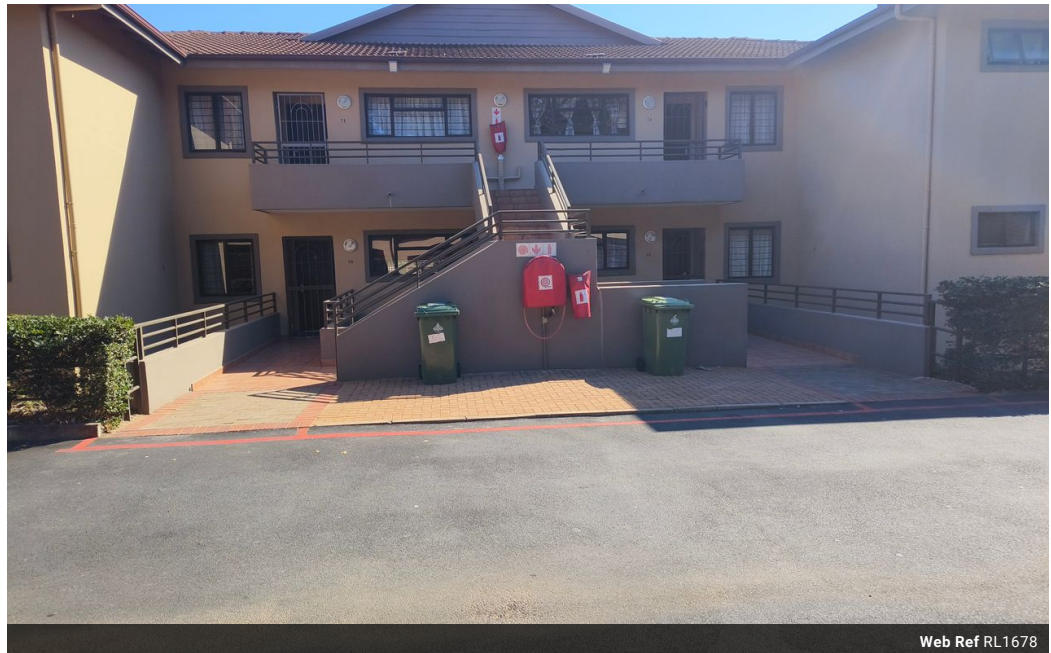
Web Ref RL1678

No 1 Bank Street (Corner Bank Street and Marine Drive) Margate KwaZulu Natal