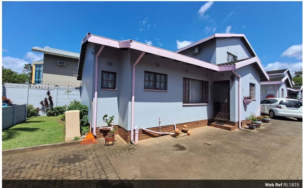
Web Ref RL1825

No 1 Bank Street (Corner Bank Street and Marine Drive) Margate KwaZulu Natal