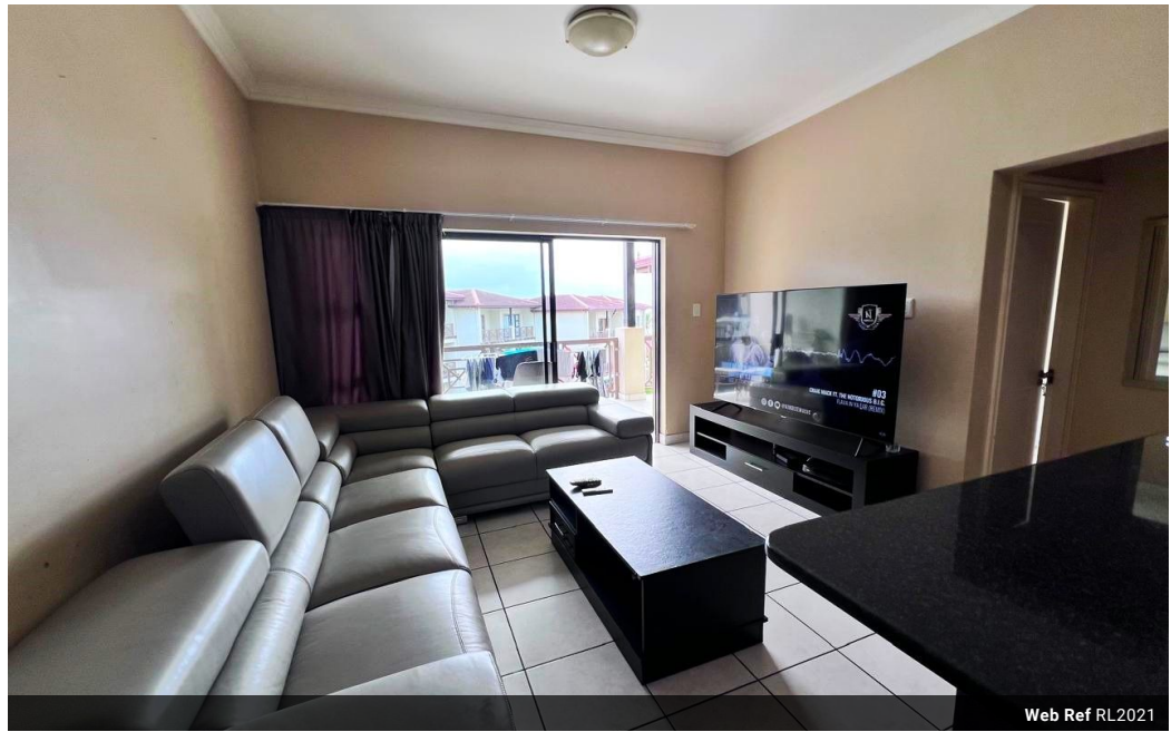
Web Ref RL2021

No 1 Bank Street (Corner Bank Street and Marine Drive) Margate KwaZulu Natal