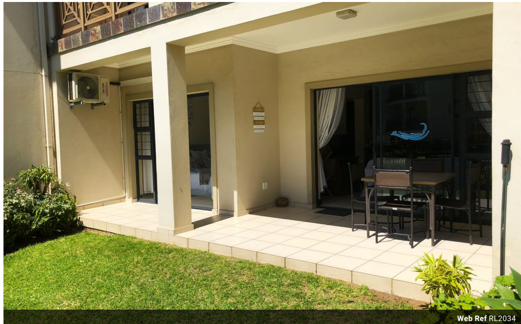
Web Ref RL2034

No 1 Bank Street (Corner Bank Street and Marine Drive) Margate KwaZulu Natal