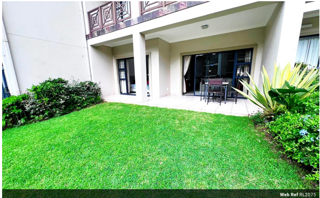
Web Ref RL2075

No 1 Bank Street (Corner Bank Street and Marine Drive) Margate KwaZulu Natal