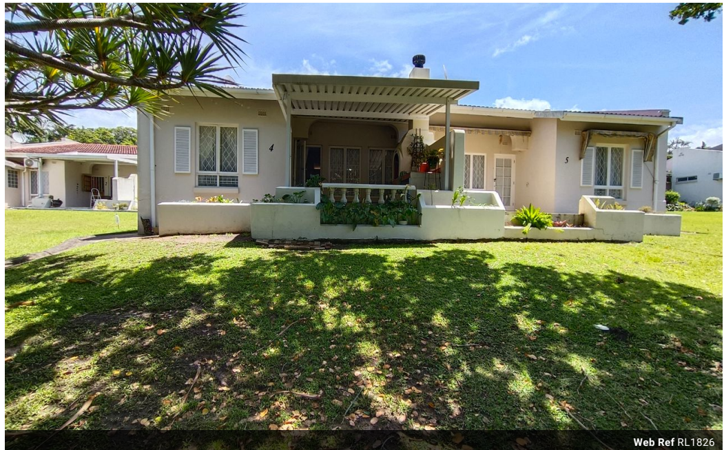
Web Ref RL1826

No 1 Bank Street (Corner Bank Street and Marine Drive) Margate KwaZulu Natal