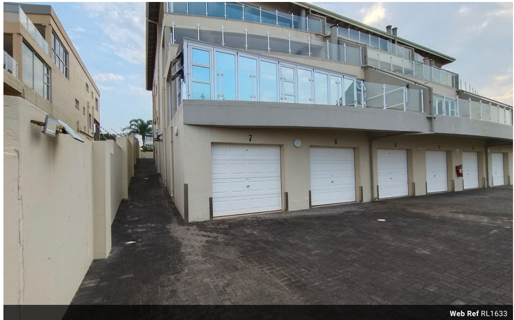
Web Ref RL1633

No 1 Bank Street (Corner Bank Street and Marine Drive) Margate KwaZulu Natal