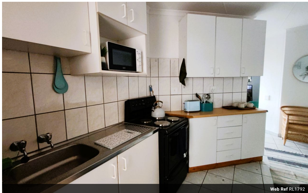
Web Ref RL1792

No 1 Bank Street (Corner Bank Street and Marine Drive) Margate KwaZulu Natal