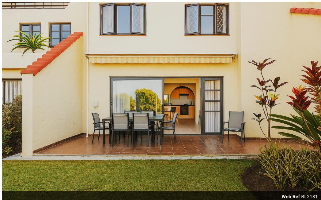
Web Ref RL2181

No 1 Bank Street (Corner Bank Street and Marine Drive) Margate KwaZulu Natal