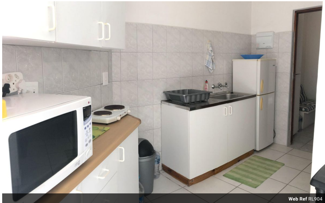
Web Ref RL904

No 1 Bank Street (Corner Bank Street and Marine Drive) Margate KwaZulu Natal