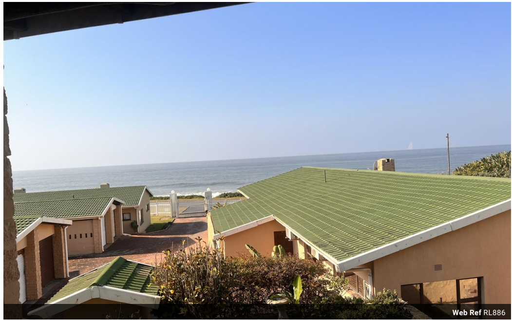
Web Ref RL886

No 1 Bank Street (Corner Bank Street and Marine Drive) Margate KwaZulu Natal