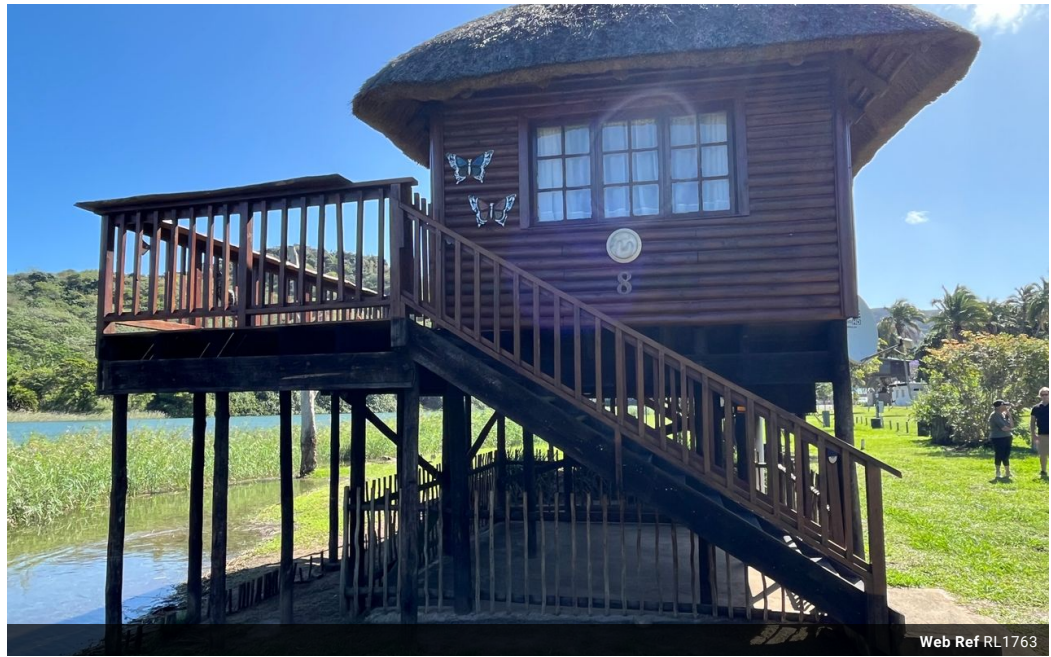
Web Ref RL1763

No 1 Bank Street (Corner Bank Street and Marine Drive) Margate KwaZulu Natal