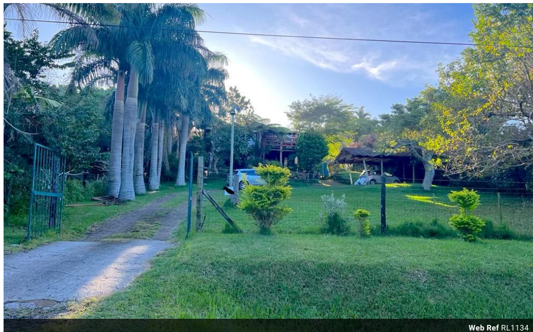
Web Ref RL1134

No 1 Bank Street (Corner Bank Street and Marine Drive) Margate KwaZulu Natal