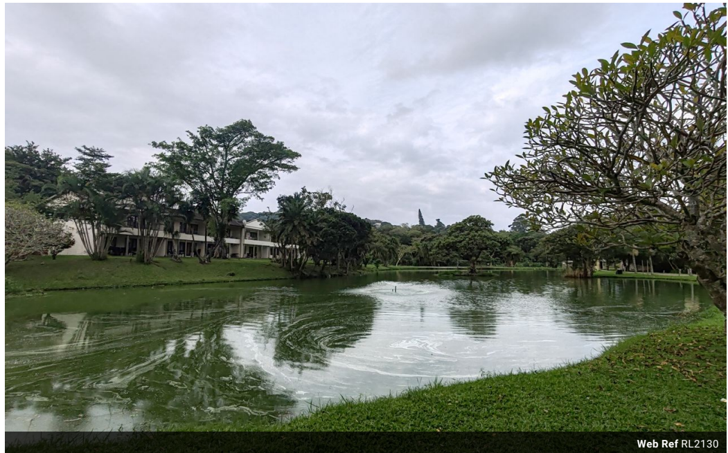
Web Ref RL2130

No 1 Bank Street (Corner Bank Street and Marine Drive) Margate KwaZulu Natal