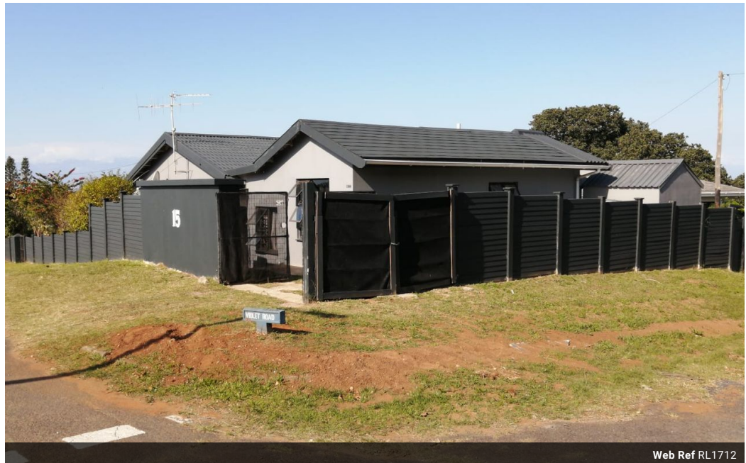
Web Ref RL1712

No 1 Bank Street (Corner Bank Street and Marine Drive) Margate KwaZulu Natal