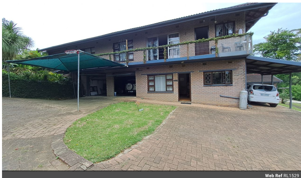
Web Ref RL1529

No 1 Bank Street (Corner Bank Street and Marine Drive) Margate KwaZulu Natal