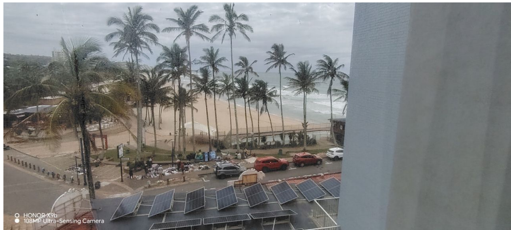
HCNOR-K9s 108MP Ultra-Sensing Camera

No 1 Bank Street (Corner Bank Street and Marine Drive) Margate KwaZulu Natal